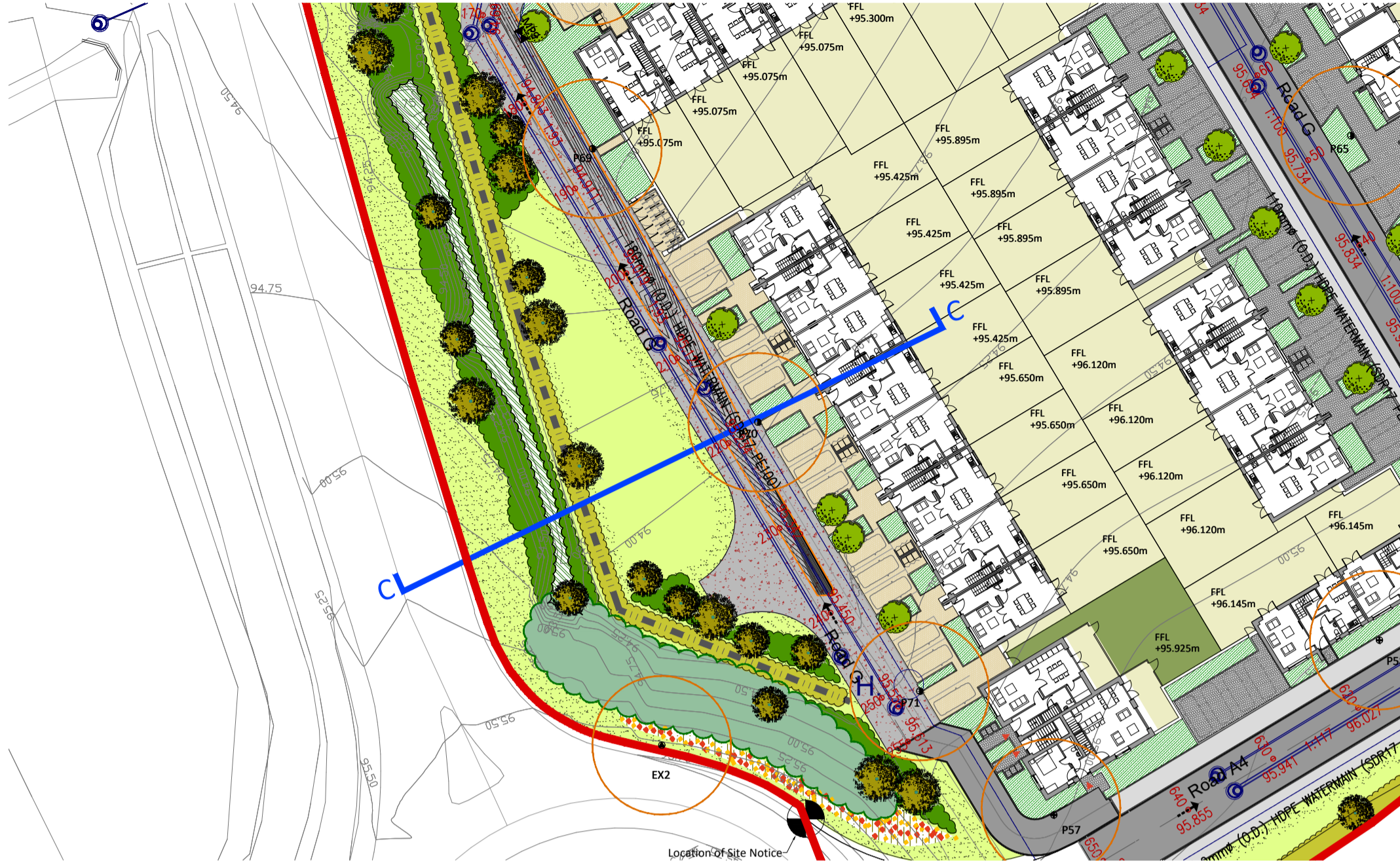
Landscape Section Location Plan Scale 1:500